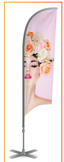
For Soft Signage