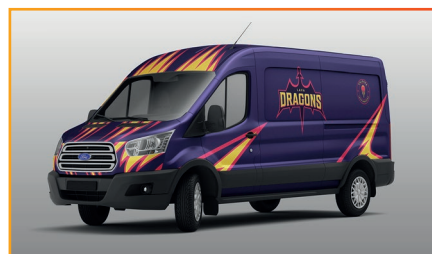
For Vehicle Wraps