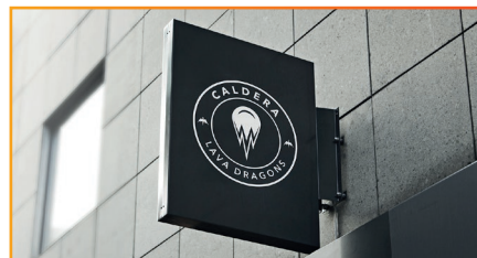
For Sign & Graphics