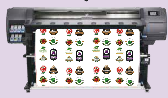
RIP, Print & Cut