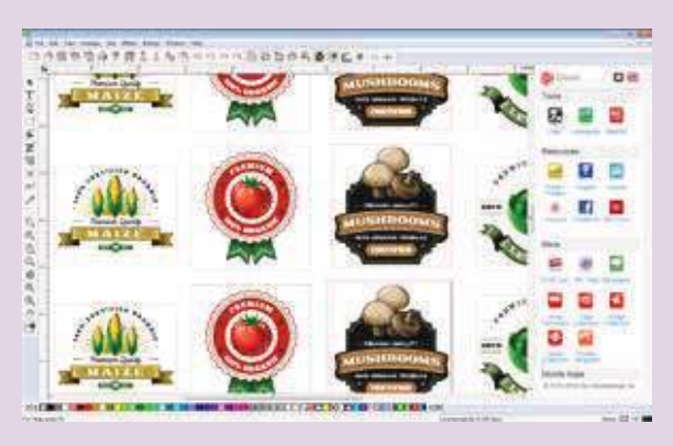
Open File and Create Contour Paths