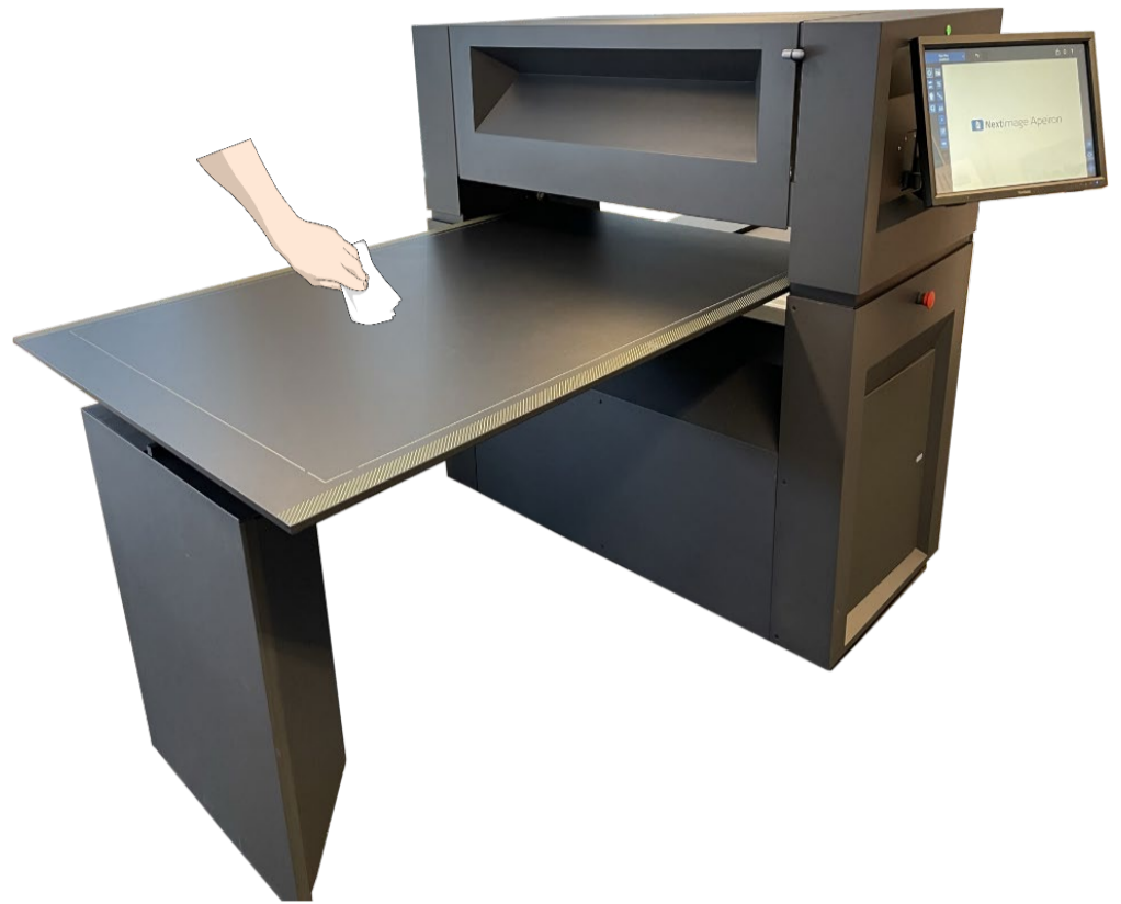
Table alignment test

Do not use abrasives, acetone or benzine Do not spray liquids directly in the scanner