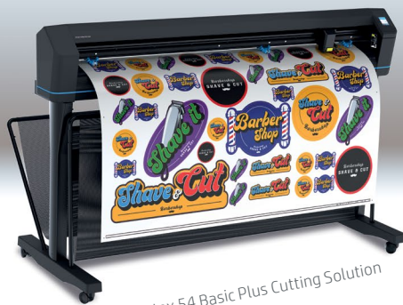
HP Latex 54 Basic Plus Cutting Solution

Grow your business by enhancing your HP Latex printer with our unique print AND cut workflow 1