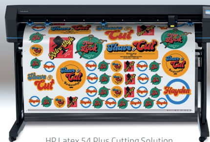
HP Latex 54 Plus Cutting Solution