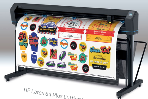
HP Latex 64 Plus Cutting Solution