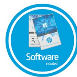
HP FlexiPRINT and CUT RIP