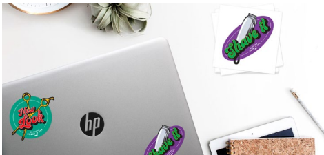
LABELS AND STICKERS