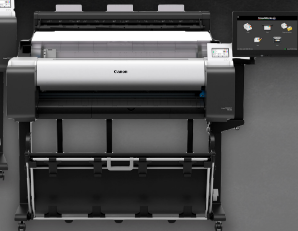
imagePROGRAF TM-355 MFP Z36